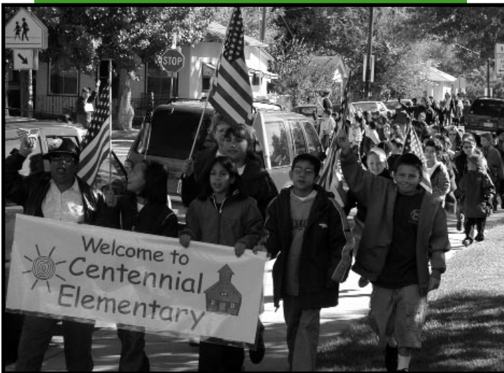
Centennial Elementary School students show their patriotism during their "We the People Parade".